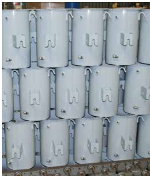
Powder coated tanks ready for final assembly

Timing is critical to Mid Central's assembly process making it important for All-Color to complete the coating as promised. Mid Central bakes the core and coil sub assembly of each unit from 3:30 pm until 4:00 am the following morning to remove all the moisture so the epoxy paper wrapping the core and coil is set. At this point the cores and coils need to be placed into the tanks. If the tanks are not ready as