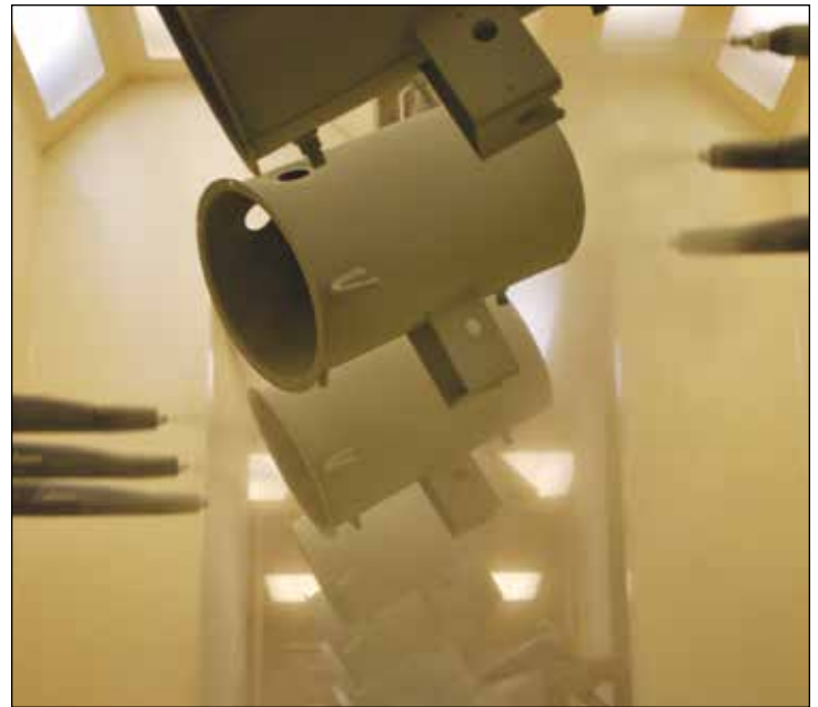
Mid Central tanks going through the powder booth