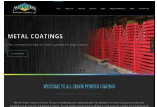
All-Color's new and improved website