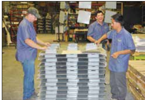
All-Color employees systematically packing SolaDeck parts