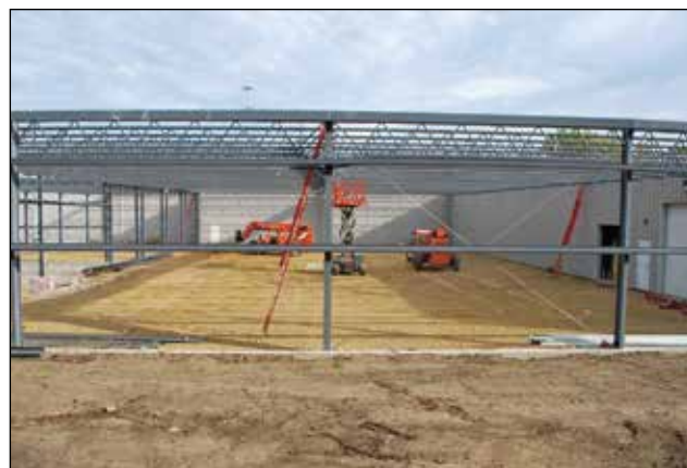
Steel framework for the new addition

Some of the most visible employees at All-Color are the truck drivers. Many of you see and interact with them on a regular basis. We are fortunate to work with these three wonderful gentlemen. Please take a minute to learn a little more about each of them later in the newsletter.