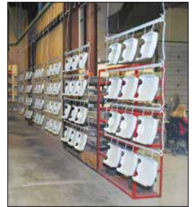
RSTC components powder coated and ready for packaging

When RSTC Enterprises, Inc. started their search for a new powder coater, they kept hearing good things about All-Color Powder Coating. The Eau Claire, WI based company was interested in having All-Color powder coat their CommDeck and SolaDeck units. The CommDeck unit is a patented satellite dish mounting system that has set the professional standard by eliminating the use of lag bolts that can lead to a leaky roof. RSTC's SolaDeck unit is a state-of-the-art wiring enclosure system that is revolutionizing the installation of roof-mounted solar panels.