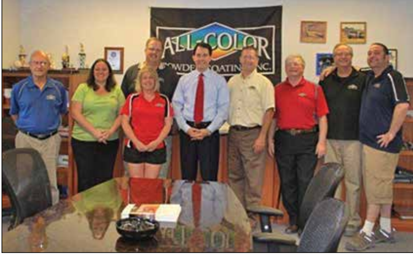
Members of the All-Color staff with Governor Walker