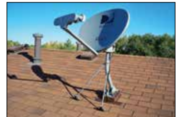
Installed CommDeck unit