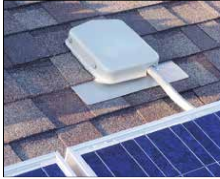
Installed SolaDeck unit