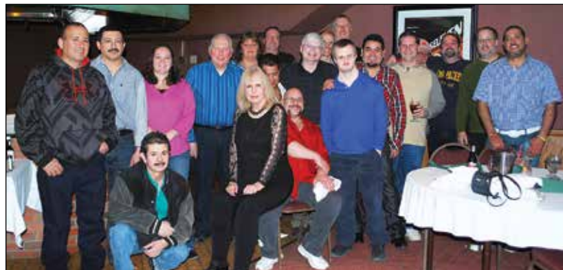
Employees gathered at Prime Quarter Steak House

The beginning of the year is typically a slower time for All-Color, but 2014 has been anything but typical. We continue to be busy with work from existing customers along with several new customers. To chase away the winter blues and acknowledge the effort put forth by our employees, they were invited to warm up by the grill while preparing a delicious steak dinner. Everyone gathered at Madison's Prime Quarter Steak House in March for a night of good food and great company.