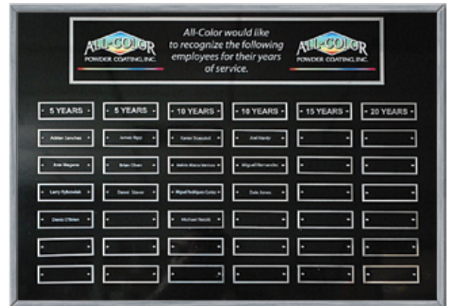
Our new Employee Years of Service plaque