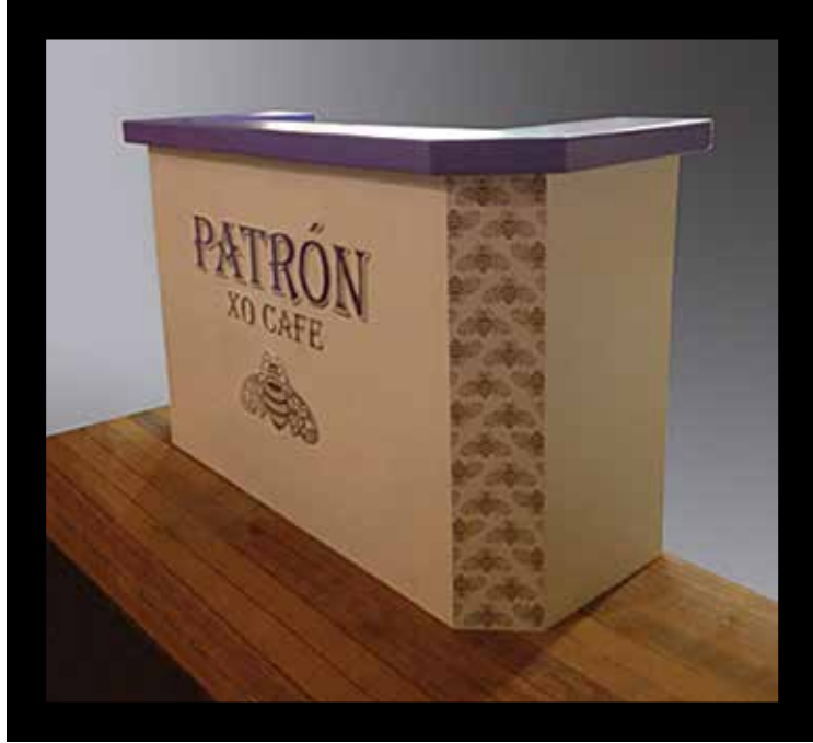
Patrón portable bar placed at ski resorts. All-Color powder coated the bar tops for Means of Production, Inc.

All-Color Powder Coating can easily handle your custom color needs. We were contacted by Jason Kingsley, owner of Means of Production, Inc. (MOP), with questions about having Medium Density Fiberboard (MDF) bar tops powder coated a custom purple color. MOP had been contracted to produce portable bar assemblies that were being placed at ski resorts to promote Patrón XO Café Tequila. The design of these portable bars required that the tops be extremely durable as well as match the particular shade of purple on Patrón's XO Café label. After searching