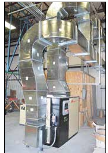
New air compressor and ductwork

The hot summers and dust had taken a toll on our previous air compressor. We recently replaced our old unit with a new, state-of-the-art air compressor made by Ingersoll-Rand. To allow the compressor to run as efficiently as possible and increase its longevity, we installed ductwork with an automatic control system. This system will send the proper amount of air to the compressor at the optimal temperature for efficient operation and even assist us in heating our building during the cold Wisconsin winters. These changes will make for a more comfortable work environment along with providing energy savings.