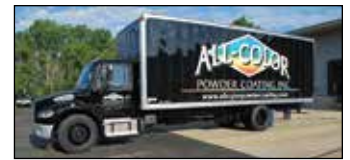
All-Color's new 2014 Freightliner

2000 Mack truck. In July we purchased a 2014 Freightliner that has already seen a lot of highway miles. Keep an eye open for the new truck cruising throughout the area.