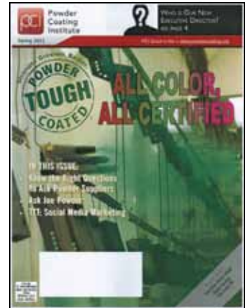
Powder Coated Tough magazine Spring 2011 cover

highlighting our flexibility with four powder coating lines. Powder Coated Tough magazine showcased All-Color as their Spring 2011 cover story. This article, as well as the "Paint Shop Pros" article in the Wisconsin State Journal , describes All-Color's actions taken to become PCI 3000 Certified, thus setting us apart from our competition. These three articles can be viewed by going to the In The News section of our web site www.allcolorpowdercoating.com .