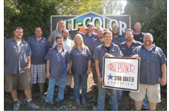
Employees gathered around the DuPont Star Coater Certification Banner

DuPont Star Coater Certified. These certifications provide you, our customer, with assurance that you will be provided a powder coated product that meets the highest standards in the industry today. Please take some time to read more about our certification from DuPont later in this newsletter.