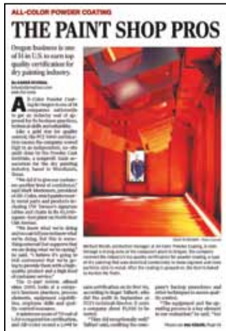
Wisconsin State Journal article

All-Color Powder Coating is celebrating 15 amazing years of service in the powder coating industry. Seeing the opportunity to fill a market niche, Mark Mortensen started All-Color in January of 1996 in a leased building with used equipment from a body shop. All-Color has grown into a successful business operating out of a modern 61,360 square foot facility employing 29 people and utilizing the most up-to-date powder coating equipment.