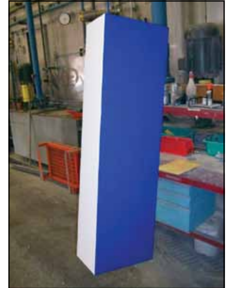
Bright blue mechanical systems cover

In May 2010, the U.S. Bank Plaza on Madison's Capitol Square won the In Business awards for Best Renovation – Office or Retail and "Best Green-Built" Project. The iconic steel and transparent building owned by Urban Land Interests and built in the early 1970's underwent extensive renovation during 2009, including updates to nearly all of its mechanical systems. All-Color is proud to have played a significant part in these accomplishments.