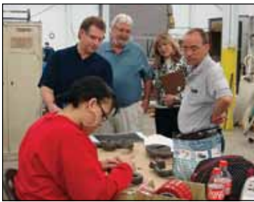
Members of the 20 Group evaluating Westside's masking operation

In our efforts towards continuous improvement, I joined the DuPont "All-Stars" 20 Group this past spring. This group of non-competing powder coaters from across the country gathers at one of the member's plants a couple times per year to review their operations. The members then report back with their observations and suggestions to help the host coater improve efficiencies, quality and overall operations. Being a member of this group is like having consultants available without the expense as other members are available to answer questions or offer help at any time. I attended my first 20 Group meeting at Westside Finishing in Holyoke, MA in April of this year. It was definitely a worthwhile experience as I came away with a number of new ideas and an expanded knowledge of what is happening within our industry in other parts of the country. The networking was invaluable and I look forward to having everyone come to our plant to provide us with honest, straightforward feedback at some point in the near future.